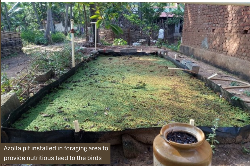
Azolla pit installed in foraging area to provide nutritious feed to the birds

Every month, several farmers from various districts visit her breed farm, as part of exposure visits. Seeing first-hand the income Parvati is earning, they are motivated to start their own desi backyard poultry activities.