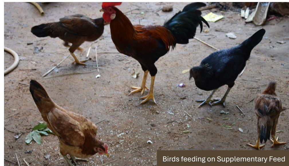
Household Seetampeta ITDA, Srikakulam District, Andhra Pradesh