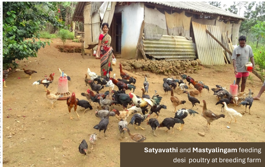
Satyavathi and Mastyalingam feeding desi poultry at breeding farm

Breed Farm Enterprise Paderu ITDA, Visakhapatnam District, Andhra Pradesh