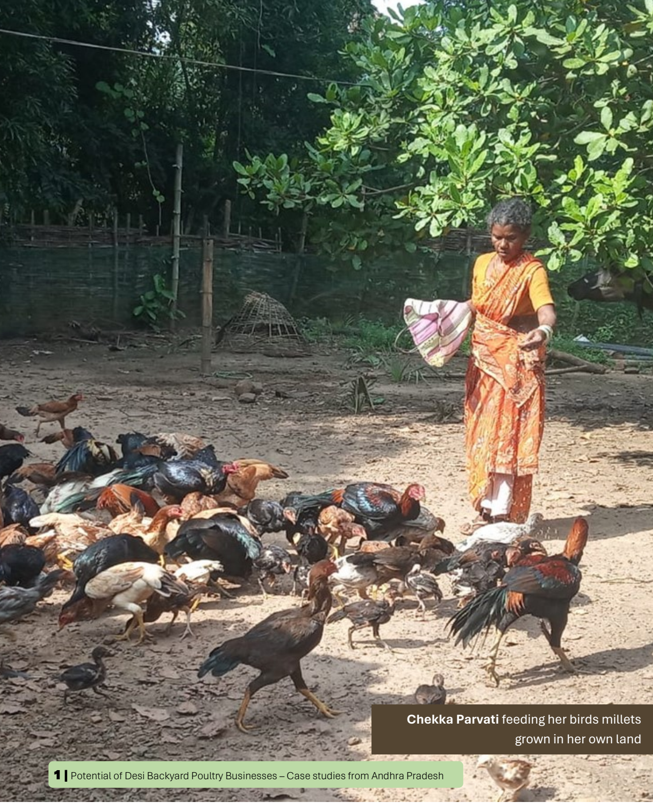
Breed Farm Enterprise Rampachodavaram ITDA, East Godavari District, a Andhra Pradesh